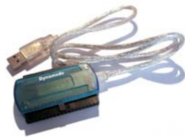
USB-IDE Converter Kit USB-IDE

With support for 2.5", 3.5" & 5.25" devices the USB-SI-C enjoys Microsoft® Windows, MAC 9.2/X® and Linux® Plug n Play compliance.